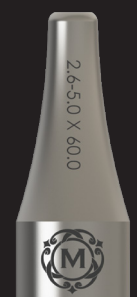
60mm x 5mm